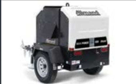
ALLMAND MAXI-POWER 8XR GENERATOR