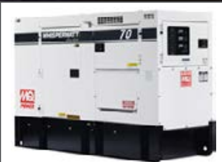
MULTIQUIP POWER GENERATOR WHISPERWATT SUPER