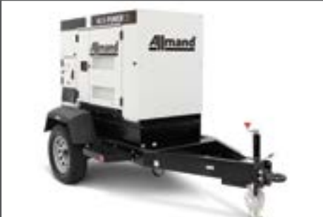
ALLMAND MAXI-POWER MOBILE GENERATOR 25