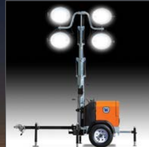
WANCO DIESEL LIGHT TOWER WITH KUBOTA D1105 ENGINE AND 6KW GENERATOR